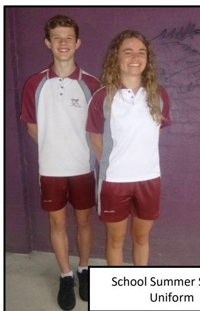
School Summer Sports Uniform