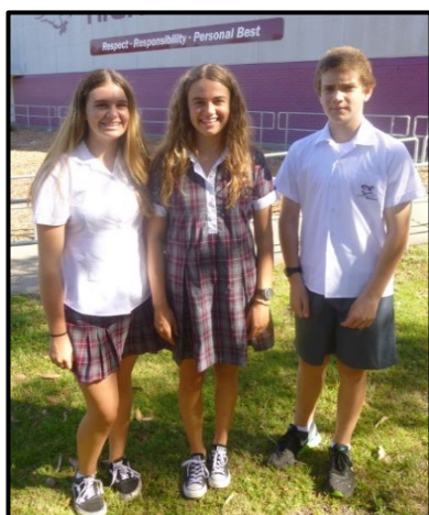
Junior Girls & Boys Uniform