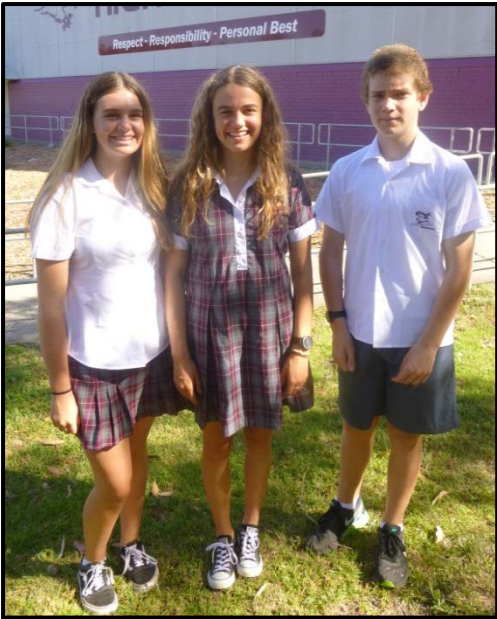
Junior Girls & Boys Uniform