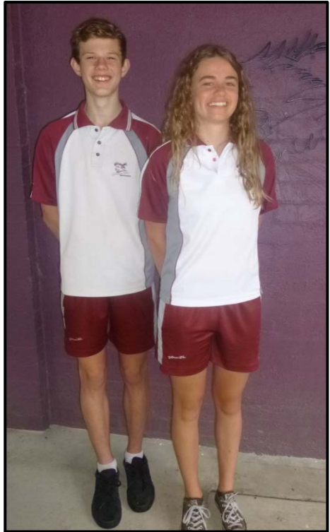
School Summer Sports Uniform