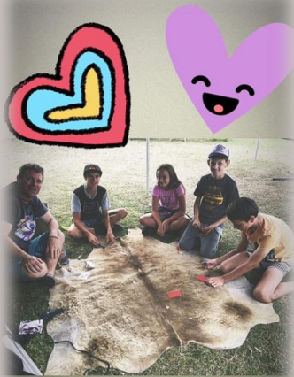
Year 7 Camp 2019