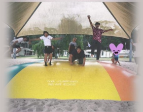
📍 LAKE TABOURIE